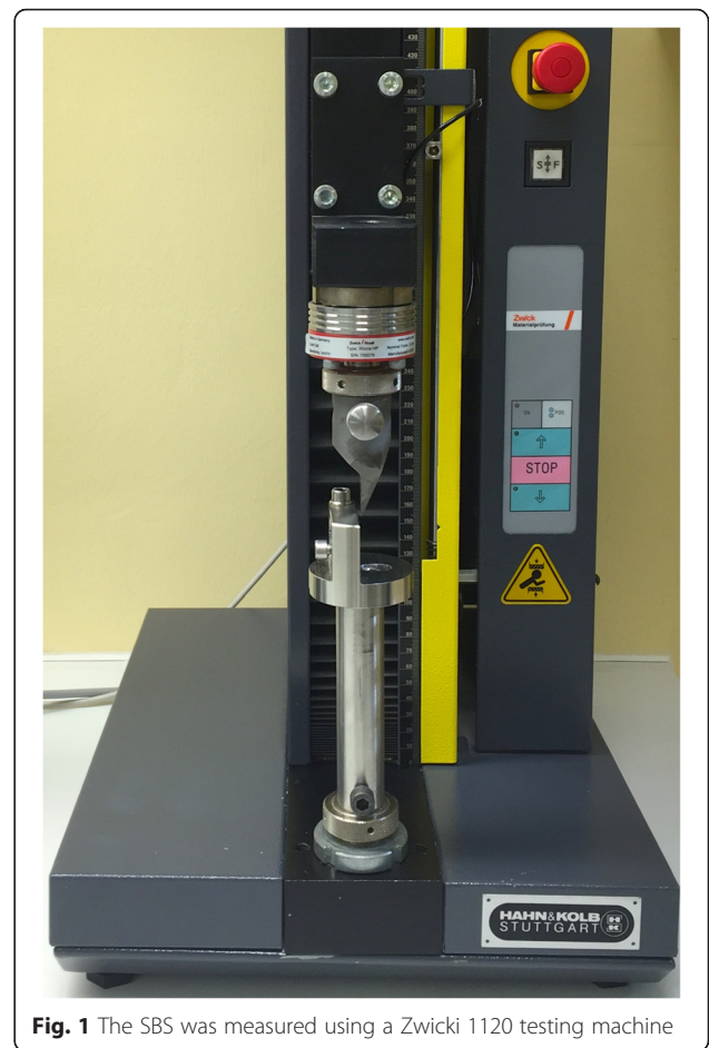
Fig. 1 The SBS was measured using a Zwicki 1120 testing machine

incisors for in vitro tests has already been widely performed in earlier studies and was found to be comparable to human teeth [17, 24, 25]. All teeth were stored in 0.5 % chloramine-T solution for in between 1 week and 6 months, according to the German DIN 1399-1:2009-05. All labial surfaces were positioned upside and parallel to the resin. All teeth were initially polished with Zircate Prophy Paste, rinsed with water and air-dried. Only those teeth were included when enamel surface was free from demineralization, color and structural alterations.