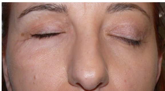
Figure 12 One month follow-up picture.