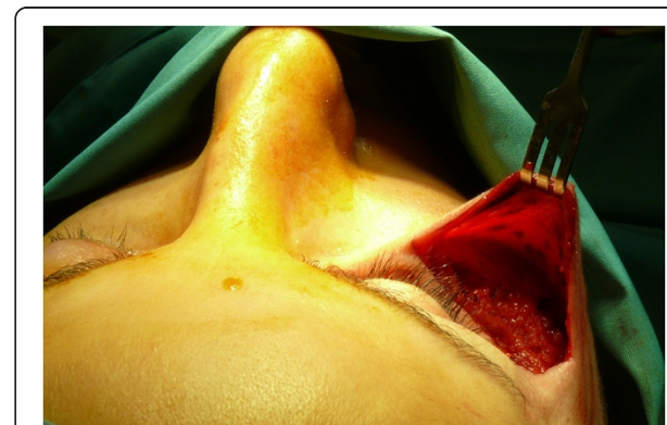
Figure 7 The bag detached around the right zygomatic region affected by tissue loss.

its proper anatomical shape, although there were still signs of postoperative edema (Figure 10).