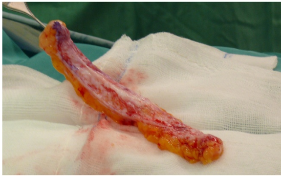
Figure 4 A dermal-fat flap taken from the abdominal region.

tissue loss; we used vascularization of the orbicularis oculi muscle to perform the graft (Figures 5, 6, 7, 8, 9).