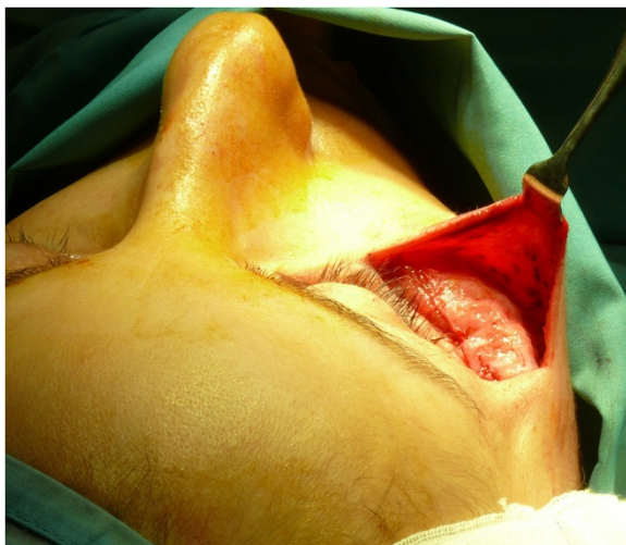
Figure 9 Dermal-fat flap filled into the bag.

The treatment of tissue loss with grafting of autologous adipose tissue in the aesthetic areas is not a widely used technique in plastic and reconstructive surgery; [1,2] as a matter of fact, general literature reports conflicting studies on the use of this procedure for tissue replacement [8-18].