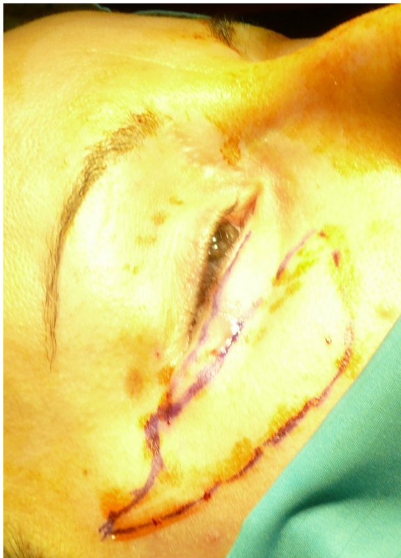
Figure 5 Design of the operative area.