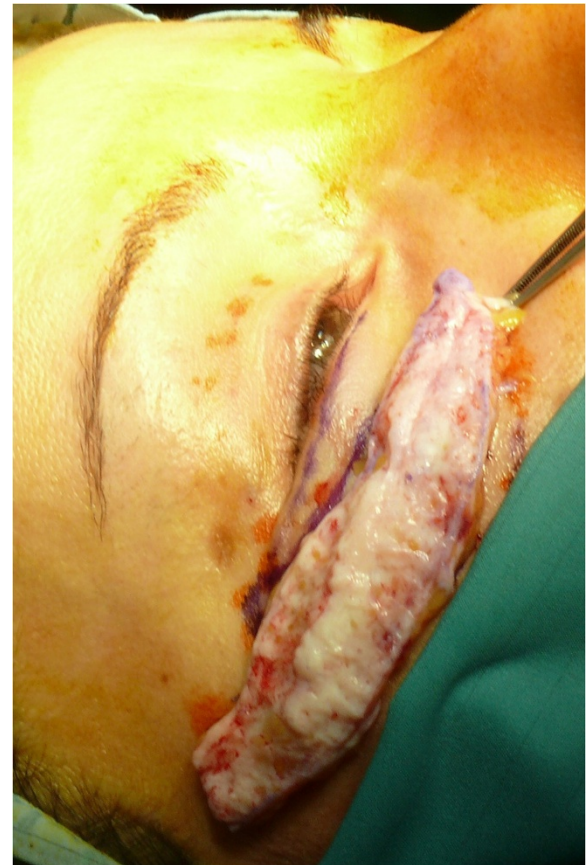
Figure 6 A slightly oversized dermal-fat flap.

The surgical outcome, 48 hours after the surgery, revealed that the right zygomatic region had returned to