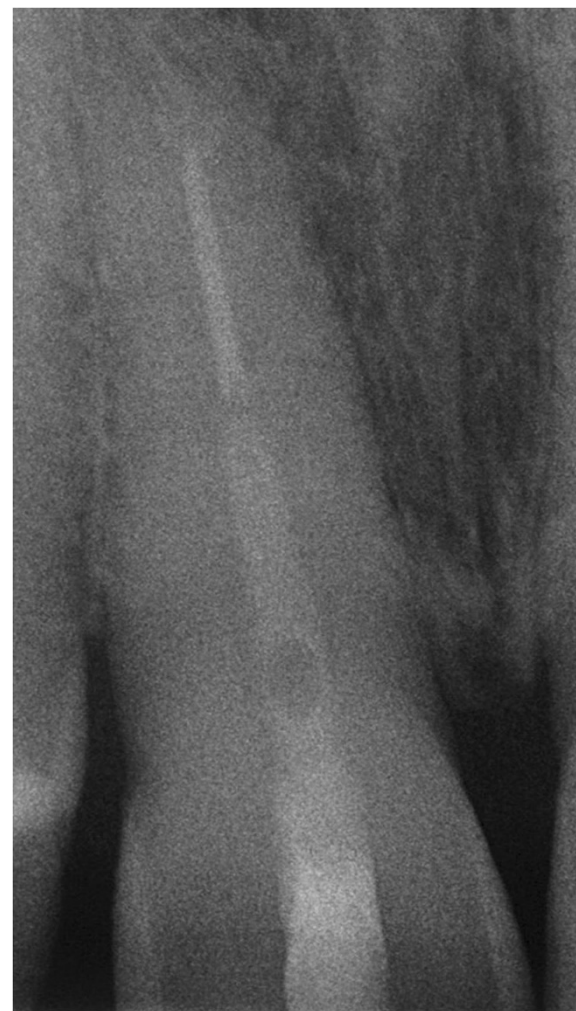
Figure 8 Control radiograph of tooth 11 24 months after replantation.

closure of radicular perforations and other dentine defects in the root [22-24]. Hence, the attempt to repair VRF with MTA has been described previously [4,17-19]. Even though ProRoot MTA has many positive features, it also has several drawbacks: difficult handling, long setting time, possible discoloration if used in the visible crown area, lower compressive and flexural strength than dentine (should not be used as a restorative base) and its high costs [25-28]. Thus, over the last years, several calcium silicate cements comparable to MTA have been presented, which can be used as endodontic repair material. One of these materials is Biodentine. It is a bioactive cement mainly consisting of tri- and dicalcium-silicate. When using Biodentine in the repair of VRF it may have some advantages compared to MTA. At first the initial setting time is about 15 min [28,29]. Even though Grech et al. evaluated the definite setting time of Biodentine to be 45 min (according to ISO 9917-1:2007) [30], this is much faster than the mean setting time for ProRoot MTA with 165 \pm 5 min [31]. Fast setting time is important for the suggested treatment option to keep the extraoral time short to avoid drying of the PDL cells and to provide a resistant filling when replanting the tooth.