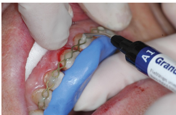
Figure 5 Replanted tooth 11 with silicone key for correct reposition and application of the titan trauma splint (TTS; Medartis, Basel, Switzerland).