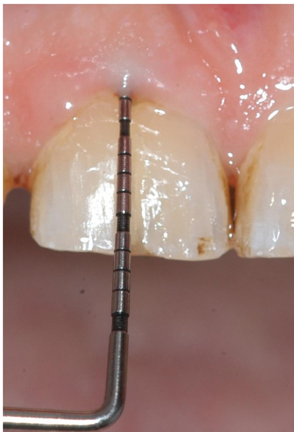
Figure 7 Periodontal probing depth of 3 mm in the area of the VRF 3 months after operation.