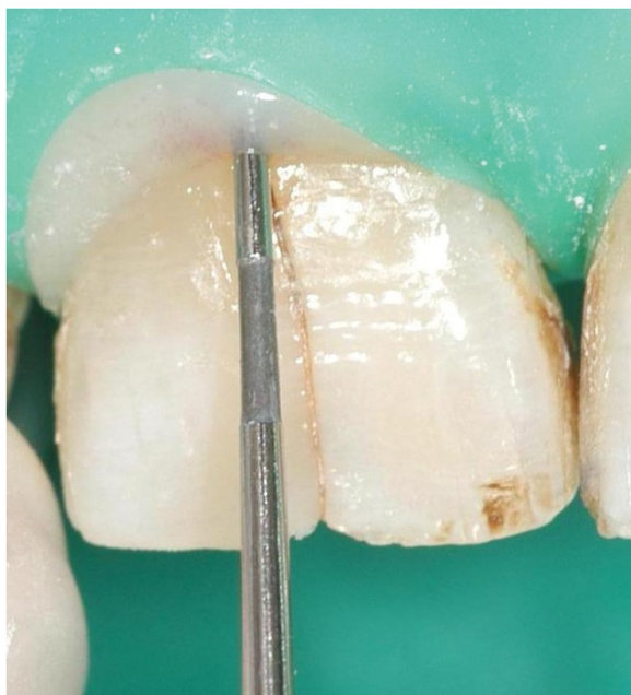
Figure 1 Fracture line on the labial surface of tooth 11 and periodontal probing depth of 7 mm in the area of the VRF.

options found acceptance by the patient (because of financial or comfort issues). So an alternative and new idea of treating the VRF was discussed, which the patient endorsed.