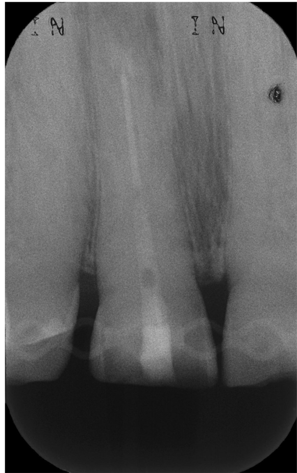
Figure 6 Control radiograph of tooth 11 after replantation.

over the whole period of time. The dental film recorded 24 months after intentional extraction and replantation does not show any pathological findings on tooth 11 (Figure 8).