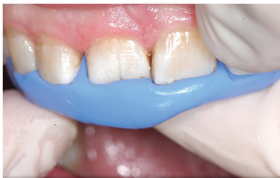
Figure 2 Restored coronal fracture line and silicone key prior to intentional extraction.

Under rubber dam isolation the coronal fracture line was enlarged with a small diamond bur. Additionally, 2/3 of the existing root canal filling was removed. The tooth was then stabilized coronally and intracanalary with a dentine adhesive (OptiBond All-In-One; Kerr, Orange, USA) and a composite restoration (Grandio/Grandio Flow; VOCO, Cuxhaven, Germany) (Figure 2). After removing the rubber dam and producing a silicon key (Figure 2), a titanium trauma splint (TTS; Medartis, Basel, Switzerland) was adapted and the area was anaesthetized with Ultracain D-