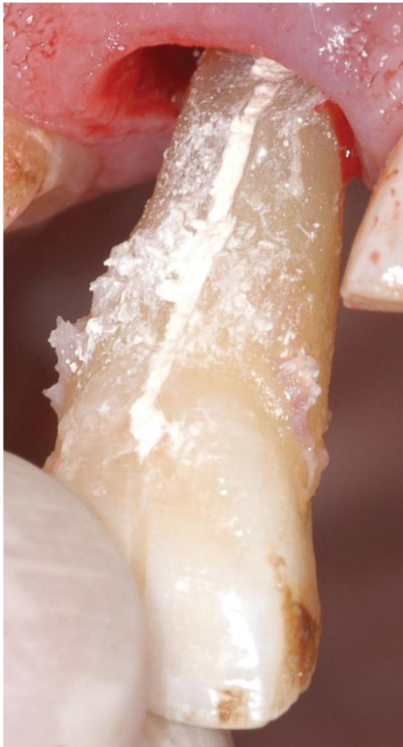
Figure 4 Enlarged fracture line filled with Biodentine (Septodont, St. Maur, France) prior to replantation.