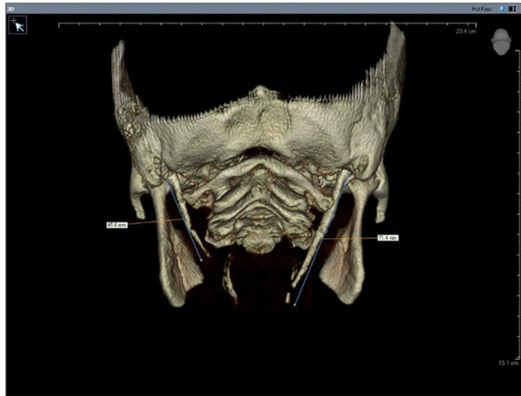
Figure 1 The measurement of the styloid process length.

and the ratio of the odds of the subjective symptoms in patients with and without elongated SP. Statistical analysis was performed using MedCalc software (version 10.1.6, Mariakerke, Belgium). P < 0.05 was considered significant.