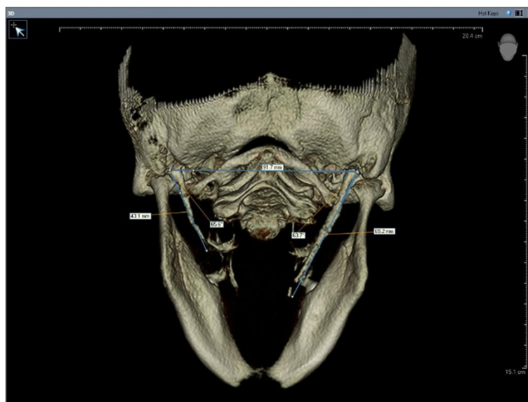
Figure 2 The measurement of the angle between the line connecting the base of the both styloid processes and the axis of the styloid process.

The types of SP and the patterns of calcification stratified according to gender are listed in Table 1. Type 2 was the most frequent type of SP encountered irrespective of laterality (212/416). The most frequent pattern of