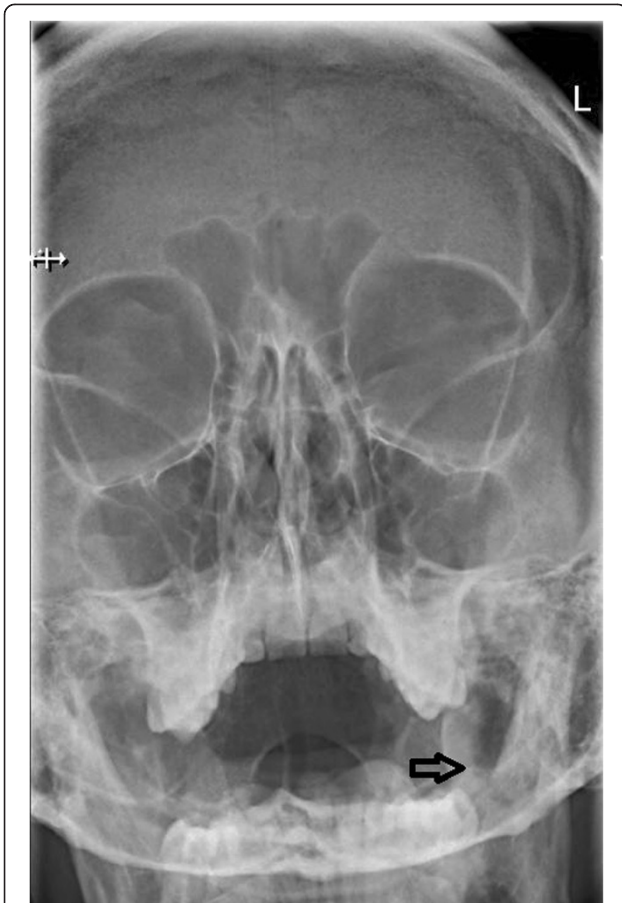
Figure 2 A plain sinus x-ray was taken at the time of patient's arrival at the emergency room. Based on the radiological report, there were no pathological findings. Due to the projection of pneumatized mastoid processes, the plain sinus x-ray has low sensitivity in detecting subcutaneous emphysema in the facial area.

has descended to the mediastinum may then descend further to the abdominal cavity via the diaphragmatic aperture [3-5]. Subcutaneous emphysema is typically associated with crepitus, and subcutaneous air can be detected relatively easily by radiological imaging. It is important to check for pneumomediastinum especially if symptoms such as dyspnea, dysphagia, chest and back pain, cyanosis, and Hamman's sign (crepitus synchronous with systole) are present [6]. Of the deep neck spaces that are limited above the hyoid bone, the pharyngomaxillary (divided further into lateral pharyngeal, parapharyngeal and peripharyngeal spaces) and the masticator spaces are located closest to the tonsil. Tonsillar fossa is formed anteriorly by the palatoglossus muscle and laterally by the palatopharyngeus and the superior pharyngeal constrictor muscle. In our case, the subcutaneous emphysema was limited to the cheek area extending inferiorly to the submandibular area and posteriorly to the parotid gland area, just under the earlobe. According to the patient's history, the swelling had first