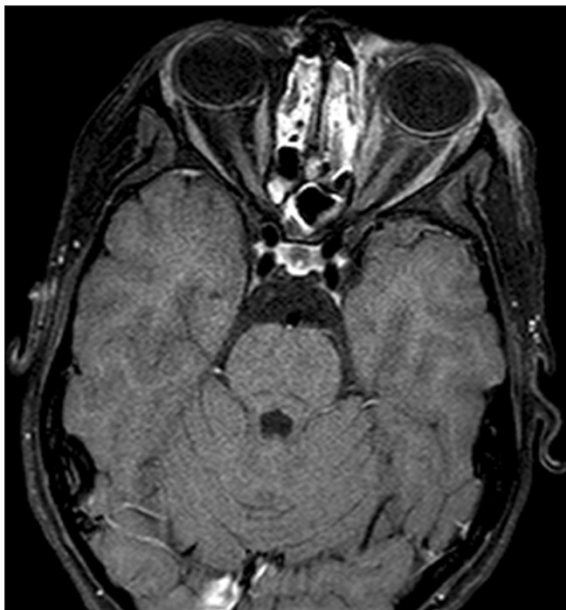
Figure 2 Axial contrast-enhanced fat suppressed T1-weighted MR. The image demonstrates ethmoid and sphenoid sinusitis and an heterogeneous enhancement of left eyelid tissues and of orbital fat. The left orbital extraocular muscles show a moderate enhancement due to edema and hyperaemia. Left medial rectus muscle is also moderately thickened.

Orbital complication accounts for 74 - 85% of complications arising from acute sinusitis and usually this is secondary to acute ethmoidal sinusitis since the ethmoid sinus is separate from the orbit only by the papyracea lamina [7]. In a paediatric series, Nageswaran et al. found that 98% and 71% of their patients with orbital cellulitis were affected by ethmoid or maxillary sinusitis respectively [5]. Furthermore bilateral pansinusitis is the most common presentation [6]. As in this case, an abscess may be present in the subperiosteum of the lateral wall of the lamina papyracea [8]. It was estimated that the incidence of a subperiosteal abscess in orbital infections is about 15% in children [6]. The etiology of orbital cellulitis is usually unknown because blood cultures are often negative. Sinus cultures reveal typical acute sinusitis pathogens including Streptococcus pneumoniae , Haemophilus influenzae , Moraxella catharralis , Streptococcus pyogenes , Staphylococcus aureus , \alpha - and nonhemolytic streptococci and anaerobic bacteria of the upper respiratory tract [5]. Subperiosteal abscess cultures showed S. pneumoniae , group A streptococci, H. influenzae , as the major pathogens in a previous paediatric series [9]. Polymicrobial infections are also common