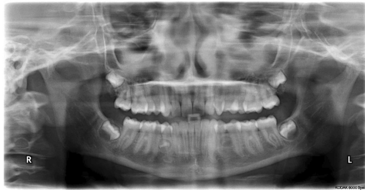
Figure 3 Orthopantomography. Image shows a bilateral opacity of the maxillary sinuses.

and may be more frequent in older versus younger children [10].