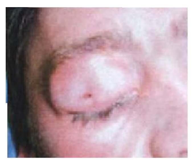
Figure 4 Patients eye after complete removal of the wire.

Moreover, topical anesthesia has been shown to be safe and effective [6] especially in this case where the patient