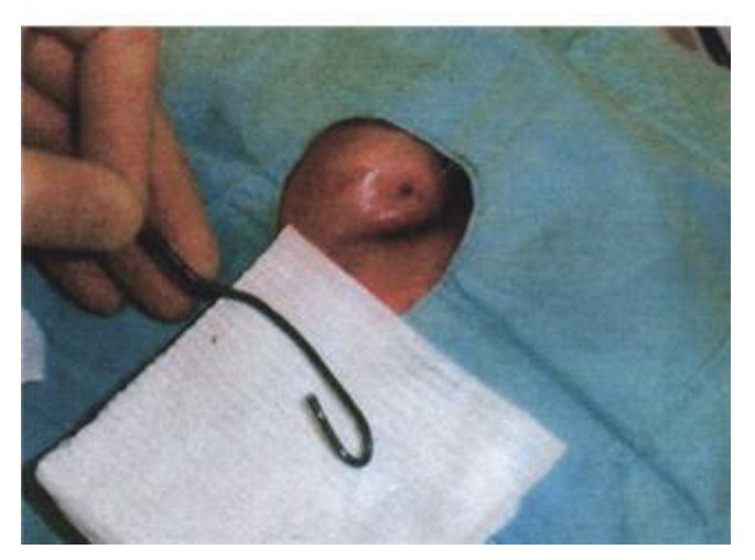
Figure 3 The wire completely removed from the eyelid.

caliber or injuries which penetrated in the opposite direction to normal.