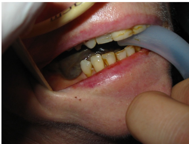
Figure 2 Sloughing of the lingual mucosa.

WG can also affect the eyes, skin, joints, nervous system, ear, nose and throat [8]. The most common anatomical site for presenting lesions of WG is the upper airway. Up to 30% of patients may present with nasal problems including nasal obstruction, ulceration, septal perforation, mucus discharge, or epistaxis [9].