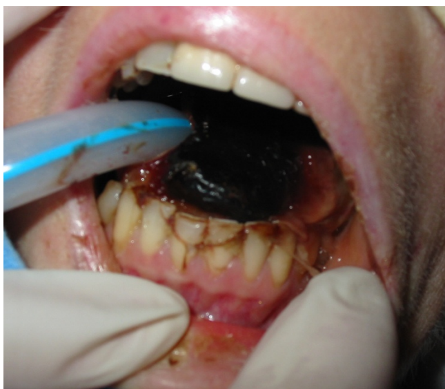
Figure 3 Necrosis of anterior two thirds of tongue.

Diagnosis of WG is based on a combination of clinical, histological, biochemical and immunological features. Inconsistency of histopathological findings can make diagnosis based on this method in isolation difficult. In 1985 diagnosis was aided by the description of anti-neu-