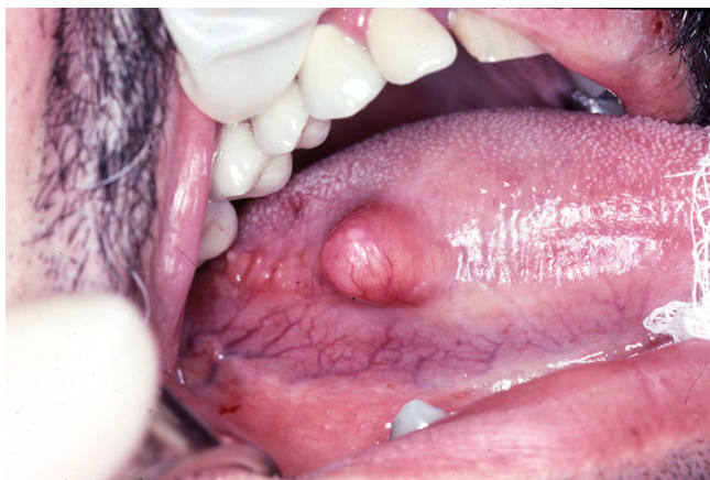
Figure 1 Gross appearance of the lesion on the right lateral aspect of the tongue.

Liposarcoma can easily be misdiagnosed clinically. Its relatively indolent course often results in a misdiagnosis of cyst or benign soft tissue neoplasm; it is frequently mistaken for lipoma [12]. Liposarcoma has been described as more firm, less easily compressed and more fixed to adjacent tissue than lipoma, and on gross inspection, as less yellow and less lobulated [12,21]. Nonetheless, many authors report difficulty in distinguishing these entities [21,22] and therefore histopathology is required for an appropriate diagnosis [12,19]. The histologic characteris-