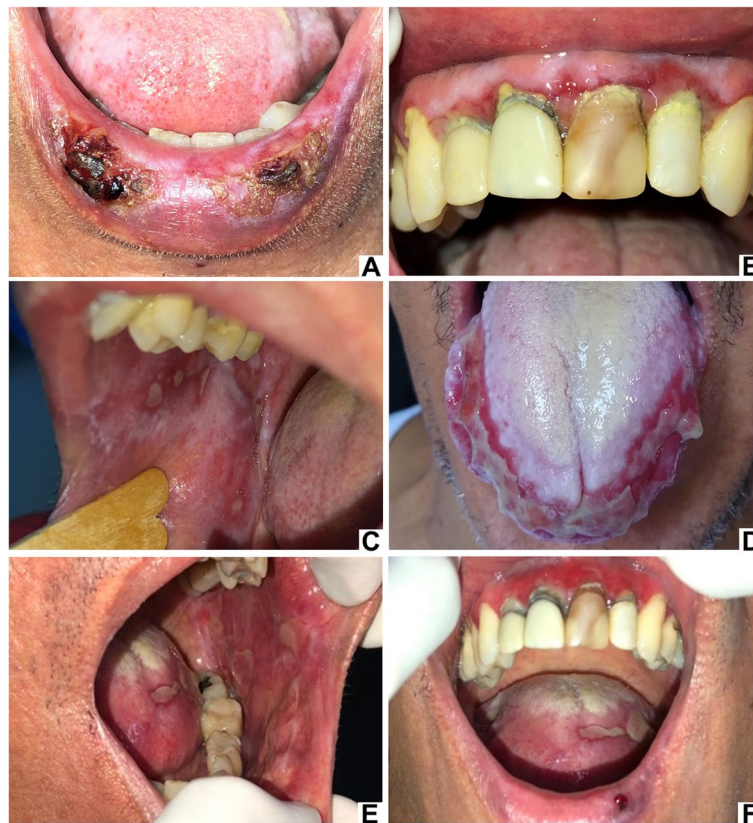
Fig. 1 Clinical aspects of case 1 during the follow-up. Lesions with an erosive/ulcer pattern and presence of crusts on the lower lip (A). Lesions with plaque pattern on the attached gingiva and atrophic pattern on the marginal gingiva of the upper incisor region - desquamative gingivitis (B). Lesions with reticular, plaque, and erosive/ulcerated patterns on the right buccal mucosa (C). Erosive/ulcerated pattern on the right and left lateral border and tip of the tongue. A white-coated tongue was also observed (D). Current clinical status of the patient. Erosive/ulcerated pattern on the buccal mucosa and tongue (E). Atrophic pattern on the gingiva - desquamative gingivitis and erosive/ulcer pattern on the tongue and lower lip (F)

and hard palate; and atrophic lesions in the upper and lower gingiva (Fig. 3 A, B, C, and D).