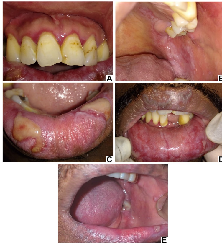
Fig. 3 Clinical aspects of case 2. Lesions with atrophic pattern in the gingiva - desquamative gingivitis (A). Lesions with atrophic, erosive/ulcerated patterns and plaque on the buccal mucosa and hard and soft palate (B). Lesions with erosive/ulcerated pattern on the lower lip (C). Reticular pattern on the upper lip and atrophic, erosive/ulcerated patterns, and plaque on the lower labial mucosa (D). Remission of lesions on the buccal mucosa, labial mucosa and retromolar area on the left side is noted. Improvement in the clinical aspect and a refractory ulcer on the lower lip after treatment - photo sent by the patient (E)