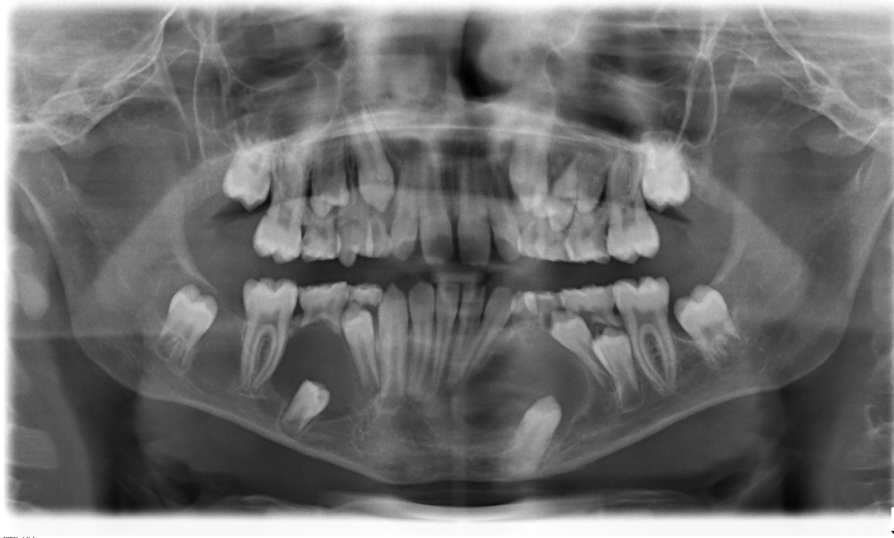
Fig. 1 Initial orthopantomogram (OPT) at the age of 11 years showing the extended pericoronar osteolyses of the teeth 33 and 45 which were retained at the base of the mandible. The adjacent teeth (32, 34, 44) seem to be dislocated by the cystic lesions. In the area between teeth 46 and 47, a diffuse osteolysis confluent with a peri-coronar osteolysis around the retained 47 is obvious. Furthermore, root resorptions at the teeth 73 and 85 are visible