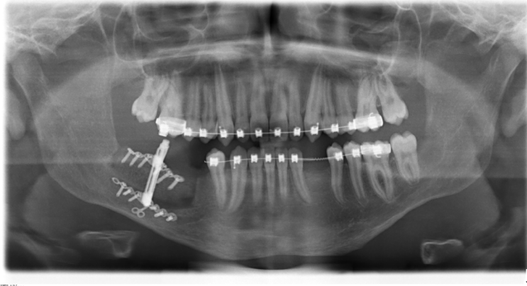
Fig. 4 Orthopantomogram after insertion of the distractor and distraction to the maximal height. Subsequently, the consolidation phase followed

restorations (Fig. 6). The porcelain fused to base metal crowns were fixed on custom made abutments. At this stage of the treatment, the patient was 18 years old (Table 1).