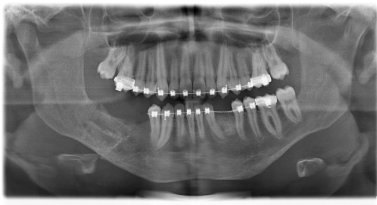
Fig. 5 Orthopantomogram after finalization of the consolidation phase. A sufficient osteogenesis in the distracted area is achieved

As shown in the presented case, cystic alterations are frequently diagnosed incidentally. In order to avoid extensive lesions, frequent dental check-ups are recommended during the growth period [14, 33–35]. A treatment including multiple medical disciplines is necessary for the rehabilitation of patients suffering from tumors [33, 36]. On the other hand, the patient's compliance is inevitable due to the time consuming and stressful therapy. Beginning