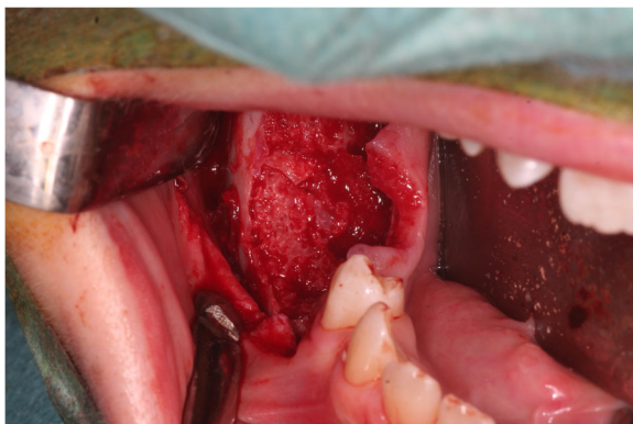
Fig. 3 The custom-made bone block in situ

The planning of the implant position was performed using the three-dimensional guided protocol of the NobelGuide® (NobelBiocare Deutschland GmbH, Cologne, Germany). In order to obtain samples for the histological examination of the augmented bone block a cylindrical trephine core of 3.5 mm diameter was harvested from region 45, 46 and 47. The samples were embedded in paraffin and stained using hematoxylin eosin. The histological examination revealed vital spongy bone trabeculae along avital bone tissue with evidence of increased remodeling. The implant insertion in areas 33, 45, 46 and 47 was performed according to the manufacturer's protocol. Subsequently, four implants (SIC invent Deutschland GmbH, Göttingen, Germany) were placed in the regions of 33 and 45 (4.0 × 11.5 mm) and in regions of 46 and 47 (5.0 × 11.5 mm). The implants were allowed to heal for 6 months. During the healing period of the implants, the orthodontic fine adjustment was carried out. After 6 months, the implants were uncovered and provided with provisional crowns. An adaptation phase of another 6 months was allowed before incorporation of the final prosthetic