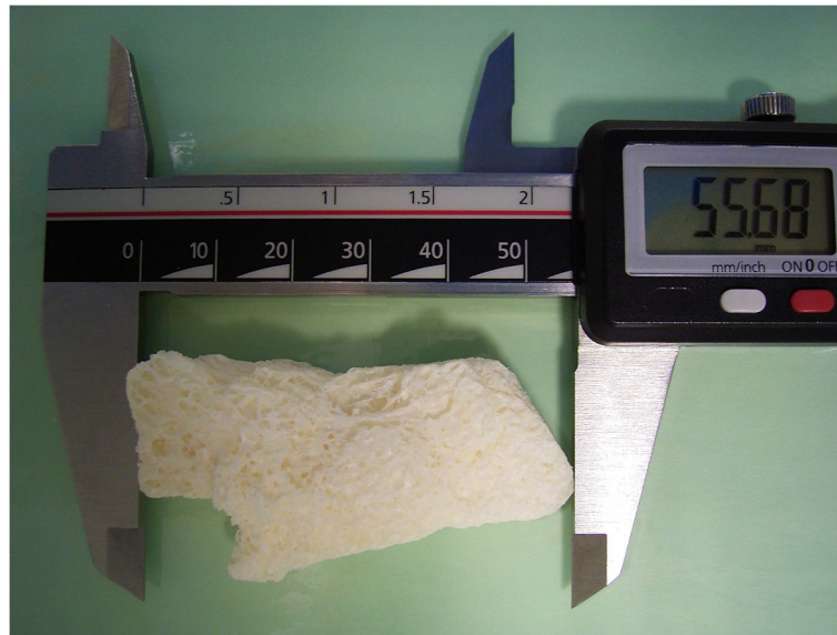
Fig. 2 Custom-made bone block prior to insertion in the right mandible. The mesio-distal extension was 55 mm

according to ossification of the radius [32]. At this age, the patient's height was already about 10 cm more than his parents'. The consultation of a pediatrician assumed the end of the growth period. Thus, it was decided to start the preparation of the implant placement.