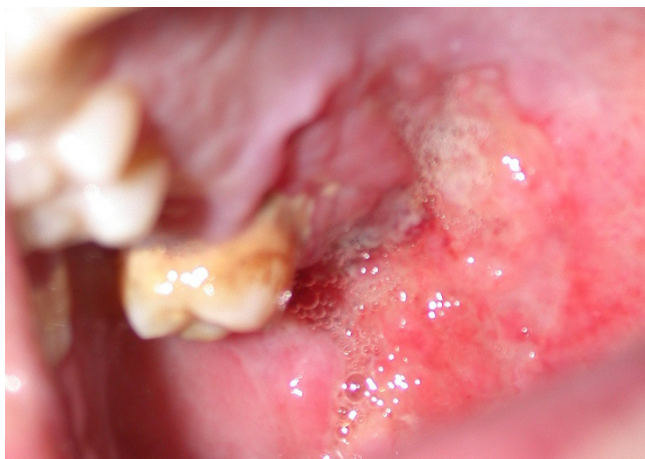
Figure 1 Preoperative hard and soft palate lesion.

At the age of seven the patient was recovered for an orthopaedic trauma. He had been diagnosed with FA at the age of seven after that pancytopenia was noticed during routine blood examinations for orthodontic trauma. He had been treated with androgenic therapy and had not received a bone marrow transplant. The haematological test revealed an early stage of pancytopenia ( 3,4 \times 10^9/l , Hb 12,3 g/dl, and platelets 13 \times 10^9/l ).