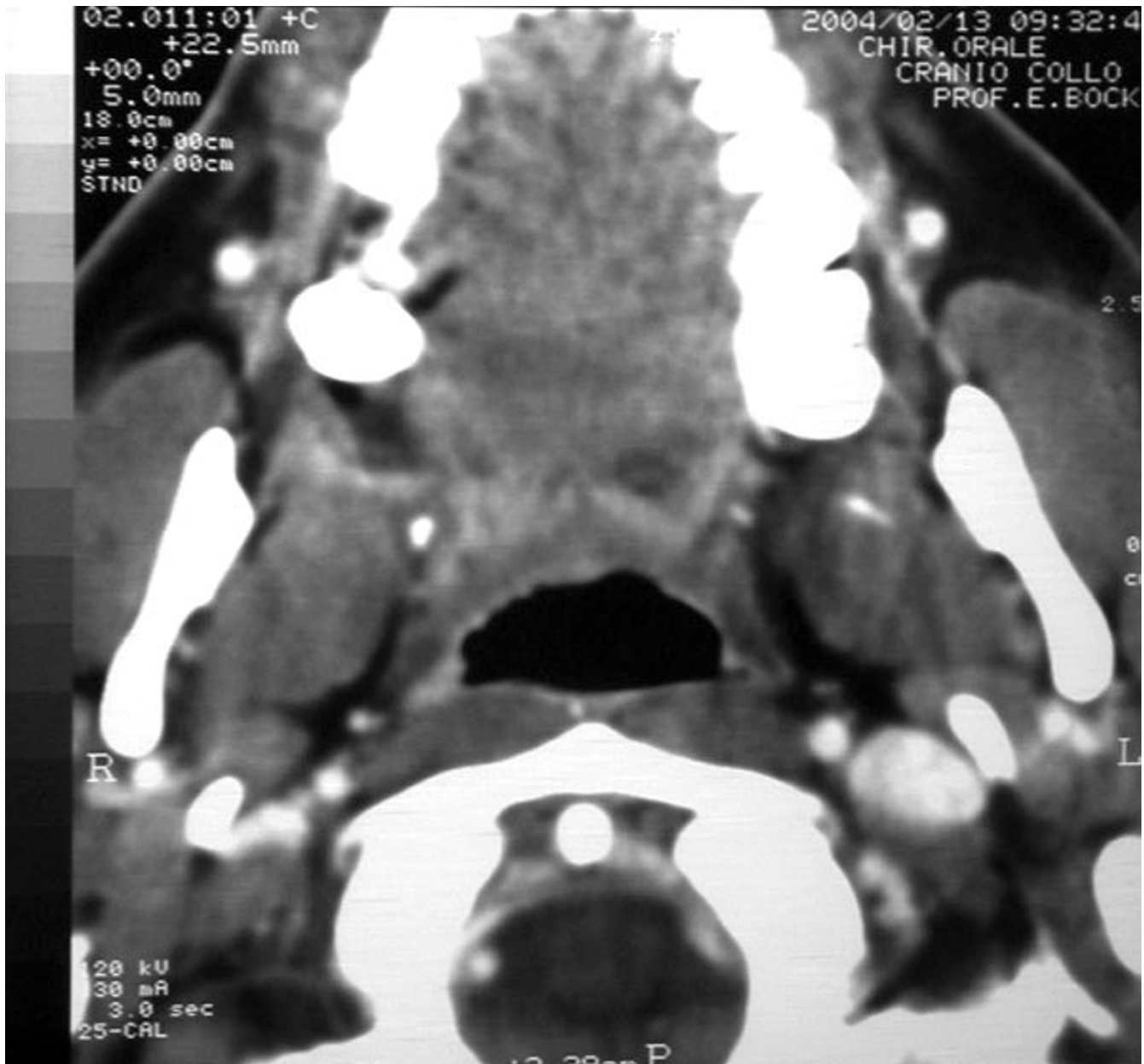
Figure 2 Preoperative CT image.

The male:female ratio of HNSCC in normal population is 2:1 while Reed asserted the reversed ratio in FA patients [16]. FA patients develop squamous cell carcinoma at significantly earlier age than the general population. Kenedy and Hart reported an average age of 27 years in FA patients [17] and the average time between age of FA diagnosis and cancer development is 10.5 years [2].