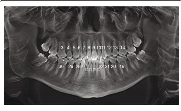
Figure 2 Notation of Teeth.

Measurements of all teeth present were made from the mesial buccal roots of the first molar on one side of the