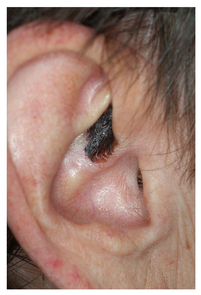
Figure 6 Superficial spreading melanoma. Dark and flat macule with variegated colors. Its borders are irregular, with indentations and notches.

A prolonged radial growth phase is characteristic for Lentigo maligna melanoma. A study by Koh et al showed that 8.3% of all head and neck lentigo maligna melanomas occur on the ear [67]. It begins as a macular lesion with a variable pigmentation with an uneven irregular border which shows a sudden increase in size, induration and darkening of the lesion (Fig. 7). The most aggressive melanoma type is the nodular variant, which is a rapidly growing dark pigmented nodule which invades the dermis early in the disease course. The thin layer of subcutaneous tissue contributes to the distinctive invasiveness and therefore bad prognosis for melanoma on the ear. Key pathologic prognostic features of auricular melanomas include the histological subtype, tumor thickness, level of invasion and presence of ulceration. Jahn et al. showed that age, locality, tumour thickness, histological type, level of invasion and excision margins to be significant risk factors for local recurrence [68]. Nevertheless the overall survival of patients with melanoma on the ear depended only on the tumour thickness and Clark level of