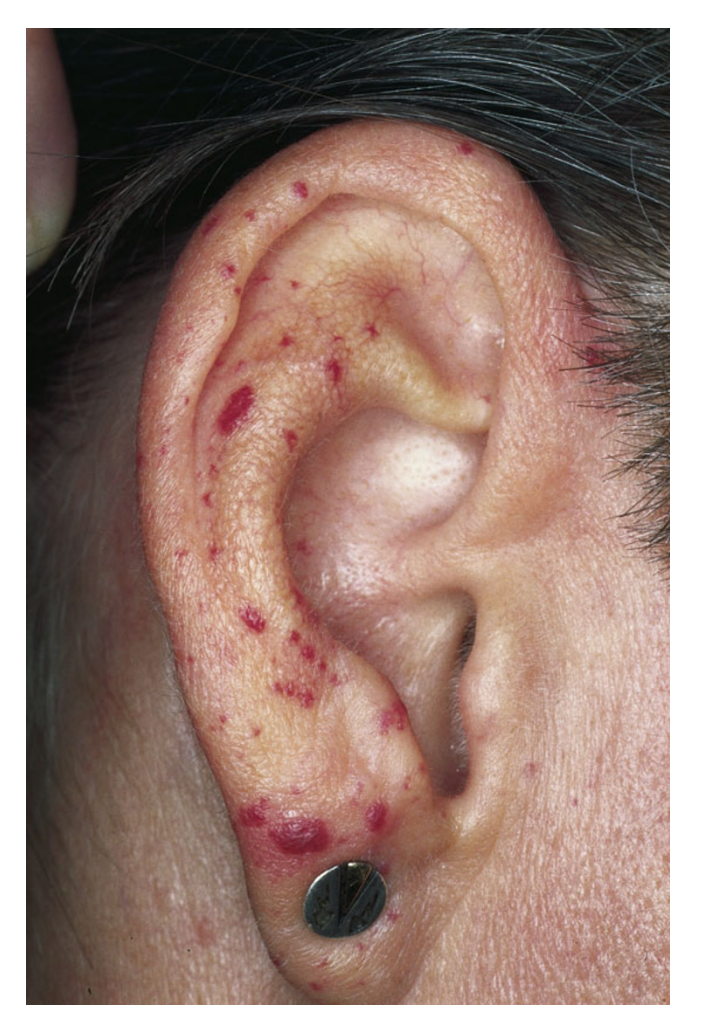
Figure 15 Osler-Weber-Rendu Disease. Multiple, punctuate, red macules and papules corresponding to hemangiomas and telangiectases.

Cylindroma (Syn.: Cylindroma, Spiegler's Tumor, Turban Tumor) Cylindroma is benign, solitary or group-like skin colored or light red, bulging, protuberand tumors with a flat, shining surface. They are usually located at the head and neck (turban tumor) and can potentially involve the ear (Fig. 12). They most likely represent very primitive sweat gland tumors originating from eccrine or apocrine glands. Histologically they show apocrine, eccrine, secretory, and ductal features, and the exact cellular origin of cylindromas remains unknown. Although benign, malignant transformation (cylindrocarcinoma) has been reported,