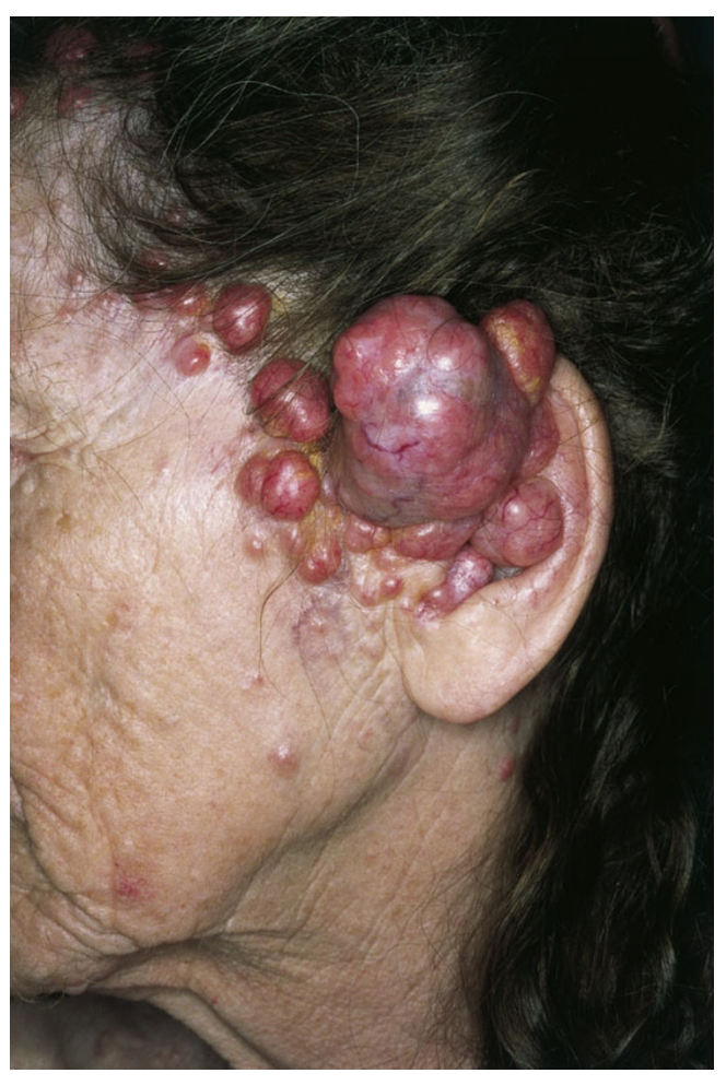
Figure 12 Cylindroma. Numerous pink, red, and partially bluish, firm nodules, affecting the upper parts of the ear and spreading to the left cheek. The distribution and arrangement of tumor masses resemble a bunch of grapes.

antibiotic treatment pseudolymphoma is one possible differential diagnosis. Small lesions can be excised.