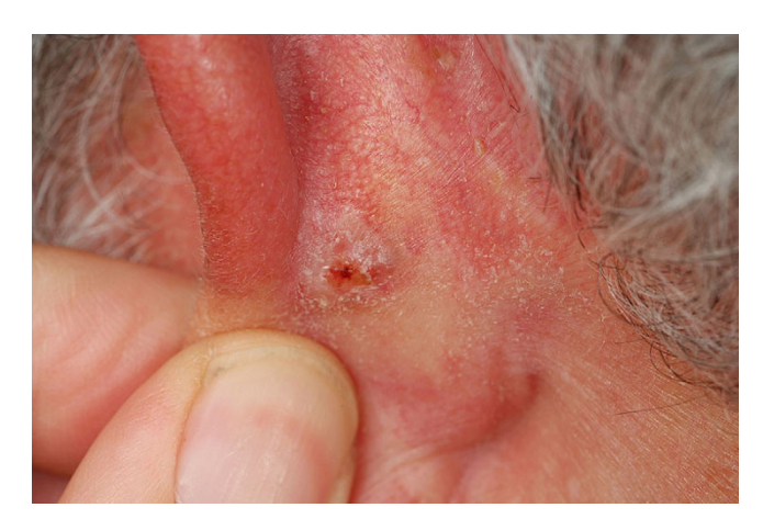
Figure 3 Basalioma. Erythematous papule with indicated pearly border. Remark the central ulceration of the retroauricular located lesion.

The most successful therapy for basal cell carcinoma is micrographic-controlled surgery (two stage operation). Five-year recurrence rates by micrographic-controlled surgery are reported to be between 1 and 5.6% [21,22]. Nevertheless, BCC found in the middle of the face (so-called H-zone), followed by those on the auricular and preauricular area have the highest rate of recurrence following treatment by excisional surgery, radiation, cryosurgery, curettage or electrodessication - all alternative forms of treatment [23-25]. Several theories attempt to explain the high rate of relapse. The ear has a complex anatomy which can confuse the assessment of tumor boundaries [26]. Further an unusual horizontal growth phase makes this tumor prone to incomplete excision [27]. As mentioned above, the skin on the concave aspect of the outer ear is very thin and close to the perichondrium. This encourages subclinical spread [23] as skin cancers grow both radially and vertically. Additionally numerous embryonic fusion planes in the auricular skin have been suggested that may