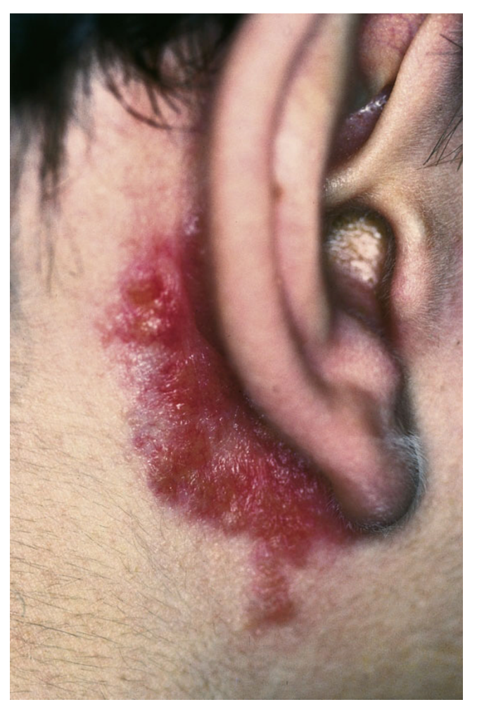
Figure 11 Cutaneous tuberculosis. Retroauricular located red, partially brownish plaque with smooth surface.

urgical excision should be preferred as lesions show a tendency to recur. A minimal skin excision should be combined with a more extensive cartilage resection to avoid recurrence [73].