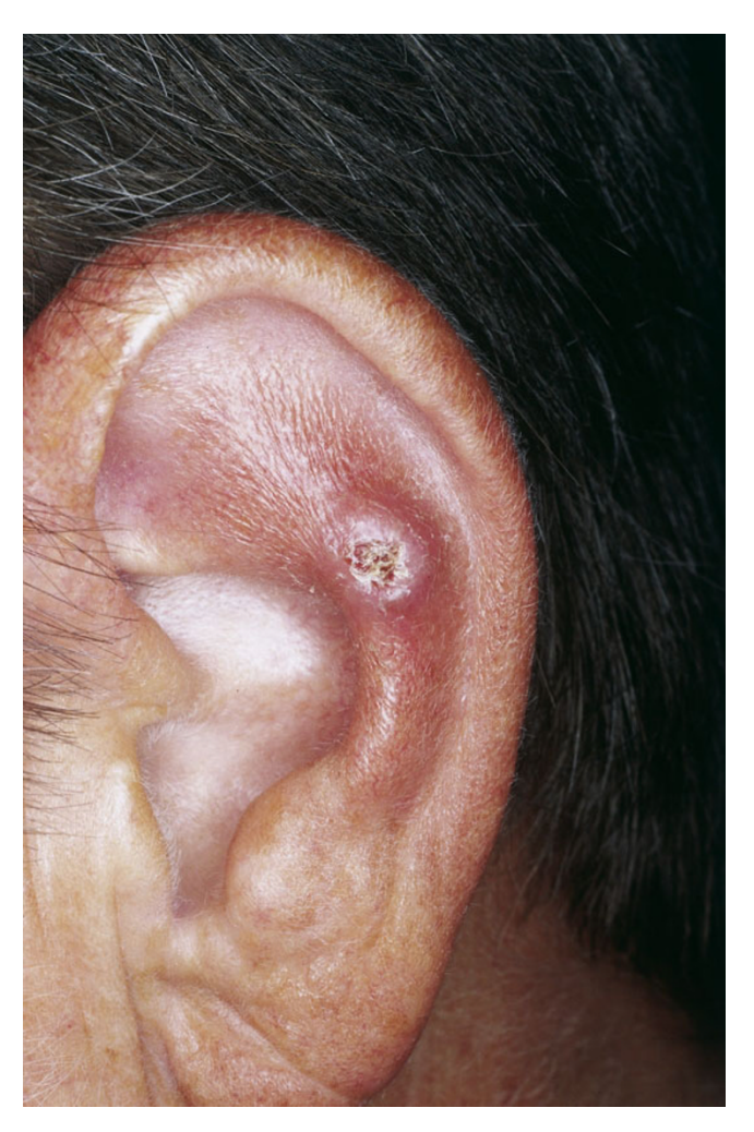
Figure 8 Winkler disease. Ulcerated nodule with overlying crust. The surrounding skin is inflamed as indicated by the red color. Remark: If painful ulcerated nodules are present at the external ear, Winkler disease has to be kept in mind.

Winkler Disease is a chronic perichondritis which is thought to be related to limited vascularity at the lateral and anterior aspect of the auricle. The skin is tightly stretched over the underlying cartilage with minimal subcutaneous tissue which results in limited vascularity and ischaemia which is thought to promote the development of this lesion [72]. Mostly located on the helix this disease is characterized by a hard nodule which involves the skin and the cartilage of the ear (Fig. 8). Patients present with severe pain in the affected ear especially when slept on it at night. Although conservative treatment (radiation, topical antibiotics, intralesional steroids) has been described