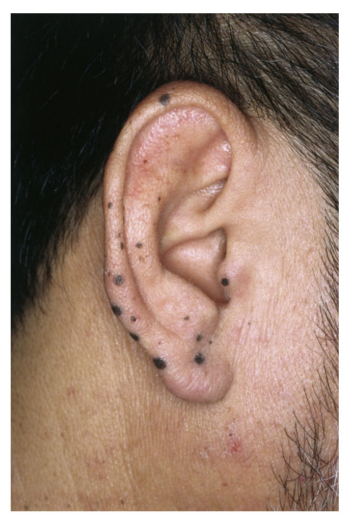
Figure 13 Multiple blue naevus: Multiple, gray to blue, pinheadsized macules affecting the external ear. If multiple blue naevi appear at the head and neck, remind that rare syndromes (e.g. Carney's syndrome) may be causal.

Auricular chondritis and perichondritis is an infection of the auricle. Clinically the ear appears erythematous, tender and a fluctuant swelling is mostly present. Typically an inciting event (piercing, surgery, trauma, wrestling, acupuncture) is followed by an infection resulting from the collection of blood or serum in the subperichon-