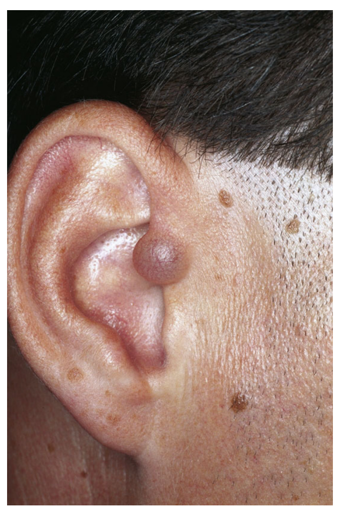
Figure 14 Auricular appandage: Dome-shaped, flesh-colored nodule with smooth surface at the upper part of the tragus.

surgical excision of necrotic tissue. As tuberculosis is enjoying a renaissance in western countries the incidence of cutaneous tuberculosis will increase in the future.