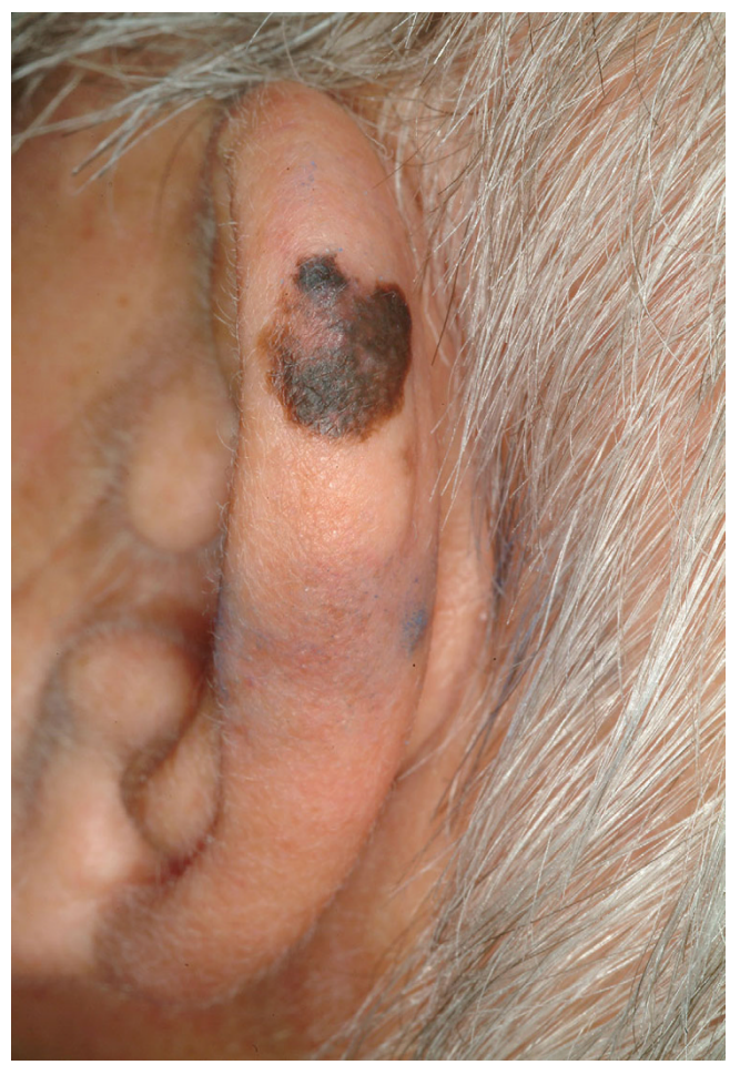
Figure 7 Lentigo maligna melanoma. Irregular pigmented and bordered, brown to black macule with visible bright to reddish regression zone.

therapeutic impact of sentinel lymph node biopsy (SLNB) in patients with melanoma of the ear. Patients with tumours thicker than 1 mm are currently undergoing SLNB and should be included in large multicenter studies. In special cases where surgical removal of a lentigo maligna melanoma is not possible, radiation therapy should be considered as an alternative with good results [69]. Unfortunately this tumor is aggressive, with a tendency for spreading to both regional lymph nodes and distant sites. One third of all patients presenting with auricular melanoma have cervical lymph node involvement. As the correlation between melanoma location and drainage is inconsistent lymphoscintigraphy with sentinel node sampling seems to be the primary method of identifying nodal disease [70,71]. However a final evaluation is not possible. Adjuvant therapy includes chemotherapy, immunotherapy, and radiation.