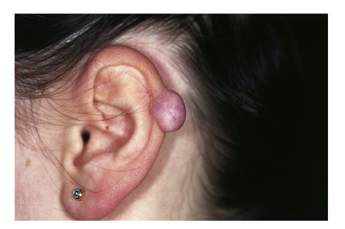
Figure 5 Keloid. Flesh colored to reddish to slight purple nodule on the helical rim. The exophytic tumor shows a smooth surface.

Keloid is first described in the Smith Papyrus from ancient Egypt [45]. It is derived from the word cheloide which was in the modern languages first mentioned by the French physician Noël Retz in 1790 and later described by Jean Louis Alibert in 1816 [46,47]. It is composed of the Greek words chele (x\eta\lambda\eta) , meaning crab's claw, and the suffix -oid, meaning like. Keloids are dermal fibrotic lesions which are considered an aberration of the wound healing process. They are included in the spectrum of fibroproliferative disorders and commonly affect the ears. Clinically dense dermal scar tissue projects above the surrounding skin which is sometimes tender or pruritic (Fig. 5). Keloids on the ear can sometimes be pedunculated. Histology shows thick hyalinized collagen bundles, abundant ground substance, few fibroblasts, and few if any foreign body reactions. They are common after small skin excisions, ear piercing, drainage of auricular hematomas, repair of other auricular traumas, viral infection (smallpox, and herpes varicella-zoster) or as secondary keloid formation after prior keloid excision. In a review of 1200 pierced ears, Simplot et al. report a keloid formation in 2.5% [48]. Several procedures have been described for