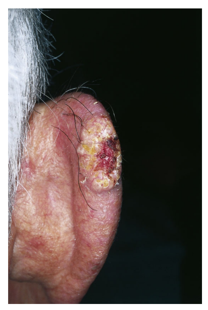
Figure 4 Squamous cell carcinoma. Exophytic, hyperkeratotic tumor with central ulceration, accompanied with seroanguinous exudate.

SCC lesions on the nose and ear have the highest rates of recurrence which might be due to an association with embryonic fusion planes [36]. Therapy should therefore be aggressive as tendency of recurrence is high [37]. A complete excision by means of micrographic surgery with tumor free margins is necessary for a successful outcome